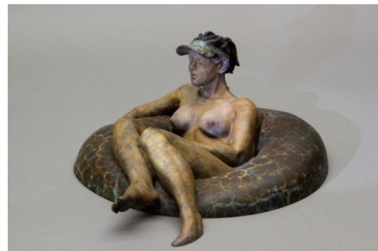
David Phelps, "Serenity Adrift," 2003, Bronze, Edition 16 of 125, 6 1/4 x 10 1/4 x 13 in., $1,860