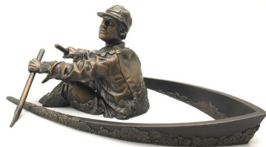
David Phelps, "Oarsman," 1988, Bronze, Edition 180 of 200, 7 x 17 x 11 in., $1,800