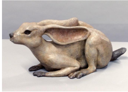
David Phelps, "Black Tailed Jack Rabbit," 1999, Bronze, Edition 11 of 49, 5 1/4 x 18 x 8 in., $2,900