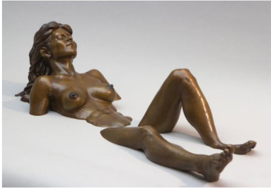
David Phelps, "American Beauty," 2019, Bronze, Edition 35, 9 x 40 x 12 in., $5,800