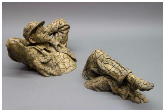
David Phelps, "Desert Pastoral," 2000, Bronze, Edition 14 of 35, 9 x 31 x 16 in., $3,800