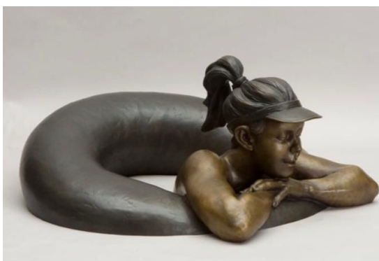
David Phelps, "Daydreamer," 2009, Bronze, Edition 4 of 35, 8 x 20 x 20 in., $4,200