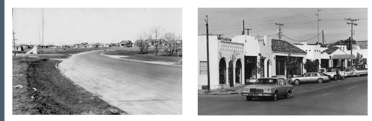
Paseo, c. 1920s

Spanish Mission architectural style, so the area enjoyed and continues to enjoy a somewhat interesting and artsy ambiance.