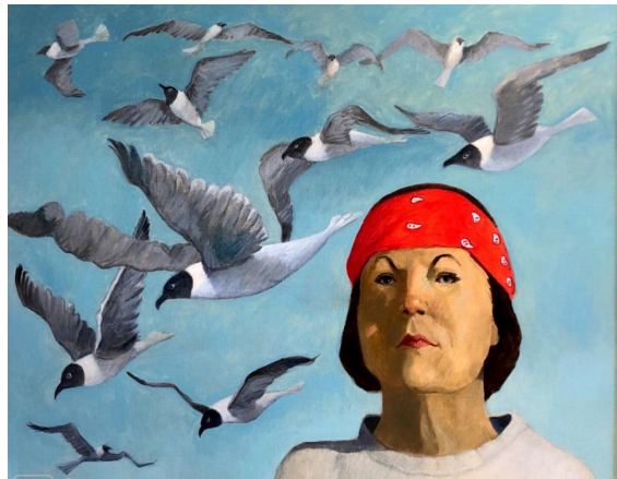
D.J. Lafon, "Morning," Oil on Canva, 32 x 40 in., $5,400