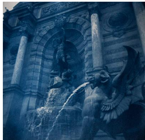
Catherine Adams, "Place St-Michel, Paris," 2012, Cyanotype, 15 x 15 in., $600