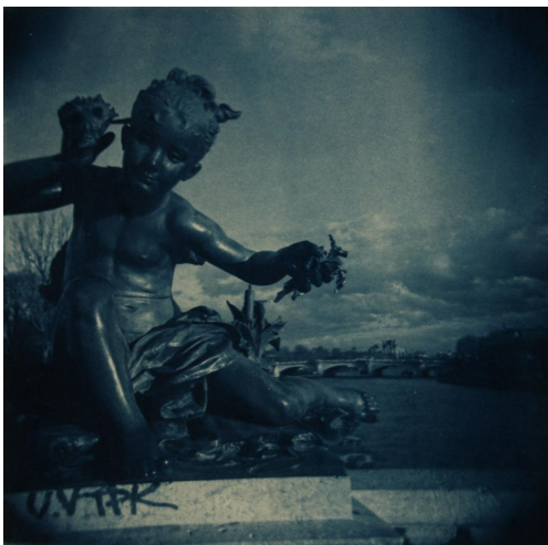
Catherine Adams, "Pont Du Alexander III, Paris," 2012, Toned Cyanotype, 14 1/2 x 14 1/2 in., $575