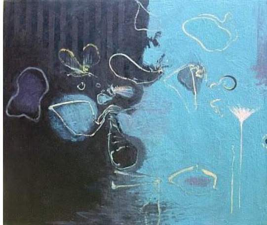
George Bogart, "Sweeping Up," 2004, Oil on Canvas, 60 x 70 in., $7,200