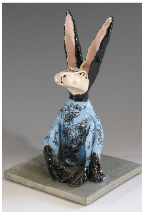
Diana Smith, "Fleur de Jack 2," Hand Built Stoneware Sculpture, 6 x 6 x 9 1/2 in., $285