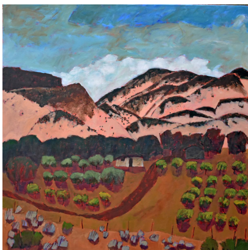
Jim Keffer, "Wildcat in the Rain," 2020, Acrylic on Canvas, 20 x 22 in., $1,375