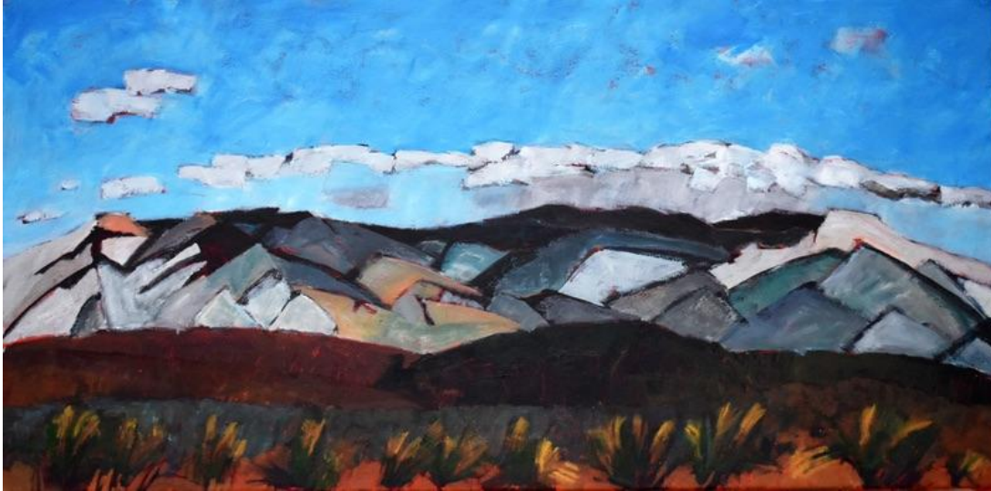
Jim Keffer, "Sangre de Cristo Range," 2019, Acrylic on Canvas, 24 x 48 in., $3,400