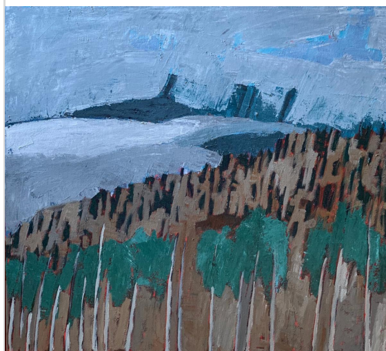
Jim Keffer, "The Orchard," 2019, Acrylic on Canvas, 48 x 48 in., $6,500