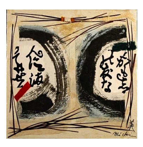
Michi Susan, "Poem 116-05," 2005, Mixed Media, 12 x 12 in.