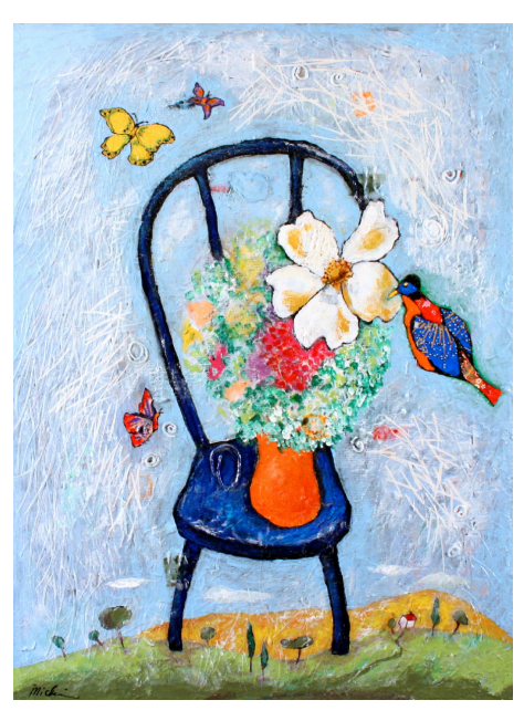
Michi Susan, "Birdsong 307-09," 2009, Mixed Media, 30 x 30in.