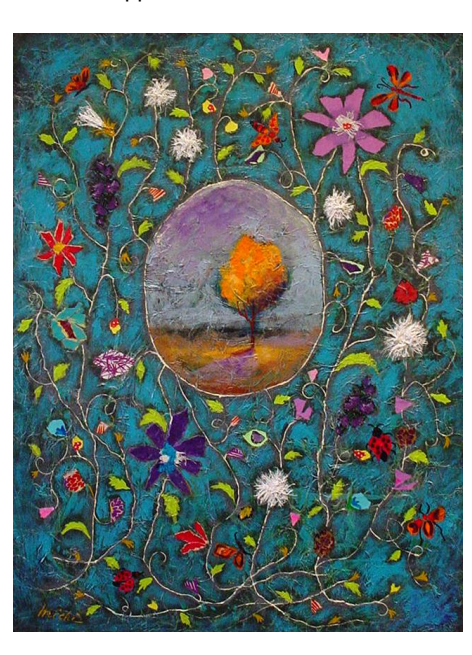
Michi Susan, "Wildflower 420-05," 2005, Mixed Media, 30 x 40 in.