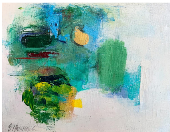
Beth Hammack, "Abstract Landscape VI," 2020, Acrylic on Canvas, 11 x 14 in., $190