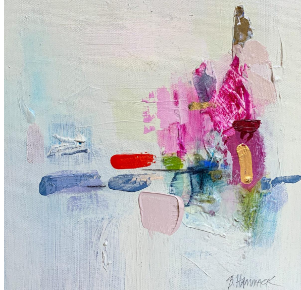
Beth Hammack, "Magenta Talks I," 2020, Acrylic on Canvas, 12 x 12 in., $150