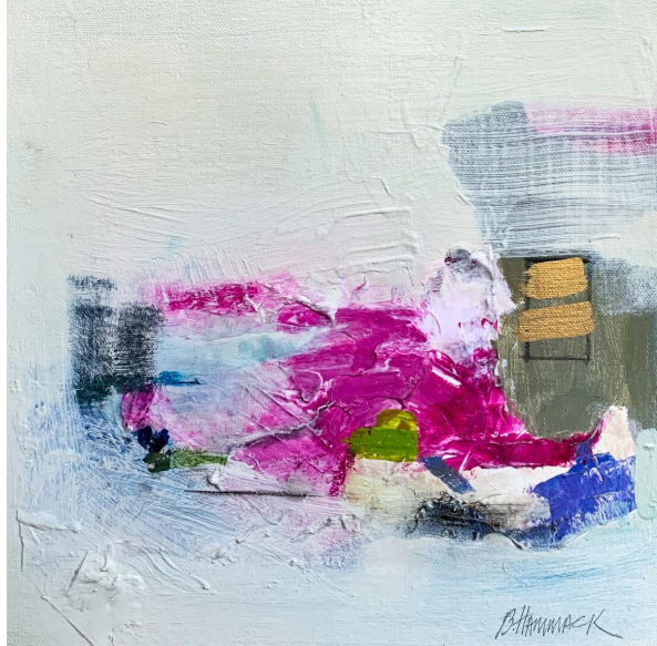
Beth Hammack, "Magenta Talks II," 2020, Acrylic on Canvas, 12 x 12 in., $150