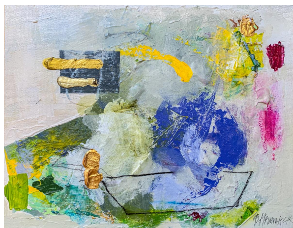
Beth Hammack, "Color Play II," 2020, Acrylic on Canvas, 11 x 14 in., $190