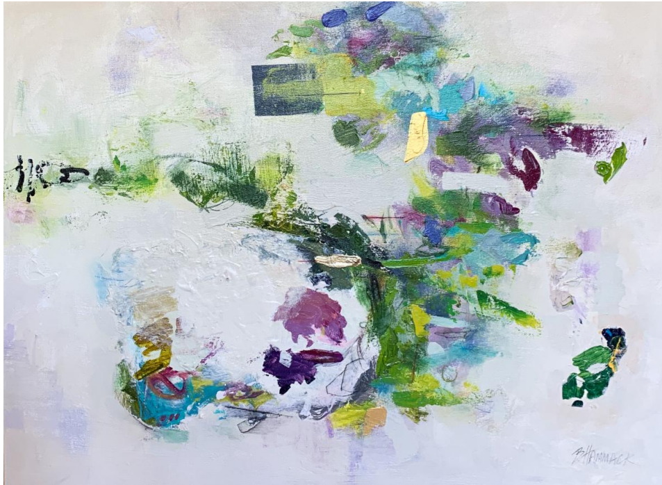
Beth Hammack, "Magenta Gardens and Ponds," 2020, Acrylic on Canvas, 30 x 40 in., $1,300