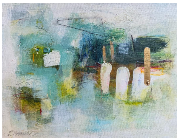
Beth Hammack, "Abstract Landscape IV," 2020, Acrylic on Canvas, 11 x 14 in., $190